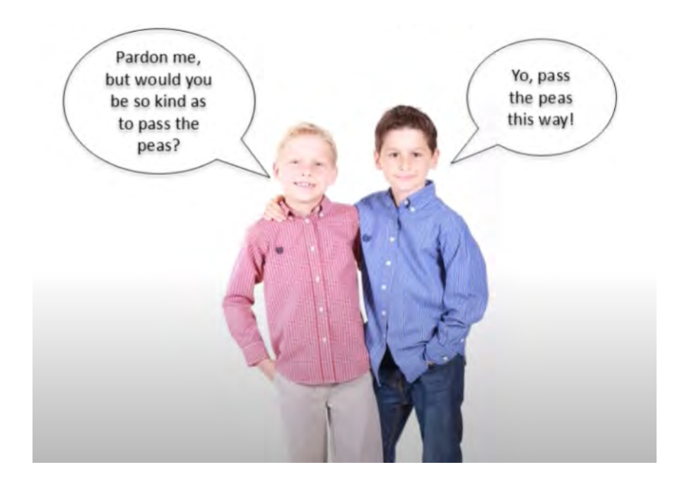
Task 1F: Some of these sentences use informal language. Some of them use formal language. Underline or highlight the sentences that use informal language.

Look at these two boys. Which boy is using formal language and which is using informal language?