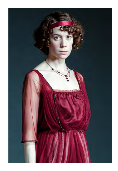
Scenario 3: Sheila Birling meets Eva Smith's ghost and has a chance to apologise for what she did. .