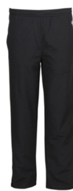
PE Track Pants