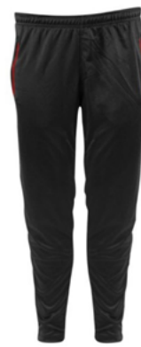
PE Training Trousers